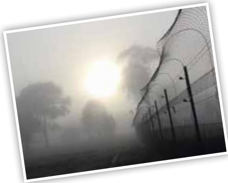
The current fence at Mulligans Flat that enables native critters to thrive free from the threat of foxes and cats.

Good news for our unique wildlife is that Mulligans Flat Woodland Sanctuary will expand into Goorooyaroo Nature Reserve behind the new suburb of Throsby. This means there will be more space for local biodiversity to thrive free from foxes and cats. In order to extend the special conditions that are possible in Mulligans Flat, we also need to extend the predator-proof fence. The construction of the extended fence will begin soon. This process marks the beginning of very exciting changes for Mulligans Flat and the Gungahlin Community.