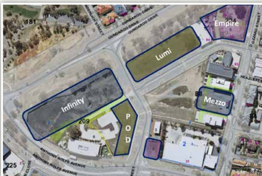
Approved (blue), Application Lodged (green) and Proposed (purple) mixed-use residential towers

A proposal has been announced for another tower – a 13 storey mixed-use residential development on the corner of Anthony Role Avenue and Gozzard Street, adjacent to the emergency services centre. It’s worth noting that this proposal, like most of the others, suggests that the “residential density and