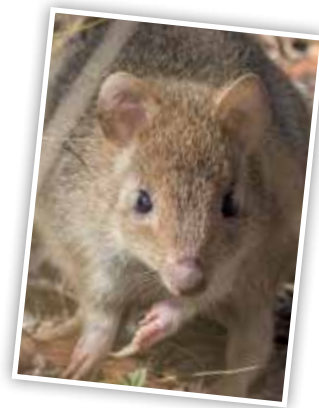
Eastern Bettong by Raw Shorty.

There are many keen-eyed photographers that spend hours absorbing the beauty of Mulligans Flat, and snapping pictures of special moments. One of our favourite pics from this month comes from Raw Shorty, who captured a rare sighting of a Bettong out during the day. Bettongs normally sleep during the day in nests they build in grass tussocks, and spend the evening foraging for underground native truffles and fungi. We don't know what this nocturnal character was up to in the sunshine, but it is always a special moment to cross paths with the beautiful marsupials.