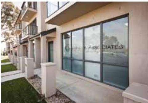
117 Anthony Rolfe Avenue Gungahlin

Our Lawyers are experienced in litigation and mediation of all types of Family Law matters and are able to provide strong guidance to assist you in reaching constructive solutions in your matter.