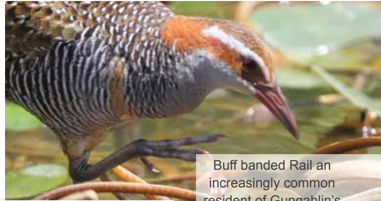
Buff banded Rail an increasingly common resident of Gungahlin's wetlands.

Gungahlin's ponds. Throughout the year single birds have been seen at Mulligan's Flat dams, Forde Wetlands and Bonner Ponds. Whilst usually secretive, at dawn and dusk it will often emerge from the thickets to feed on exposed mudflats. The Buff-banded Rail was not recorded breeding in Gungahlin last year but as the wetlands are now reaching maturity this species, and other crakes and rails, will gradually become fulltime Gungahlin residents.