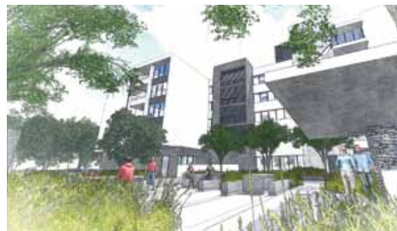
Open Recreation Area

the Common Ground Canberra initiative, with land being provided in the Gungahlin Town Centre.