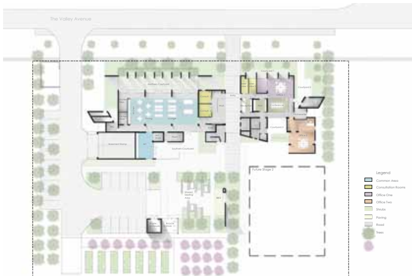
COMMON GROUND CANBERRA