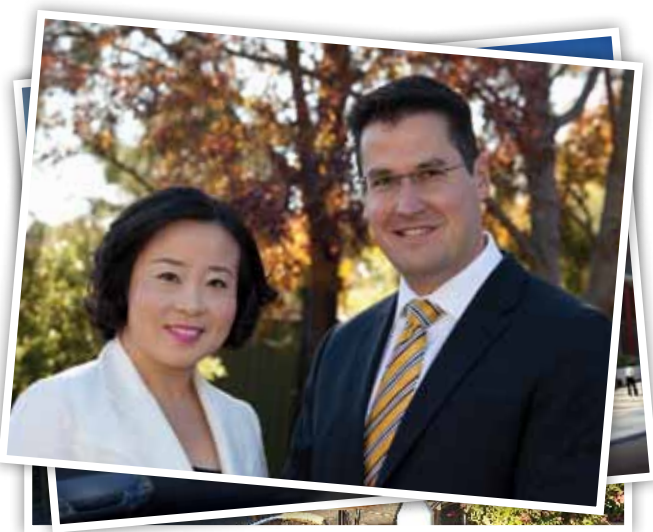
Liberal for Fraser - Elizabeth Lee and Liberal for the Senate, Zed Seselja.

Elizabeth and I want to know the issues affecting you and your family, please contact us by emailing info@canberraliberals.org.au or calling 6273 5155.