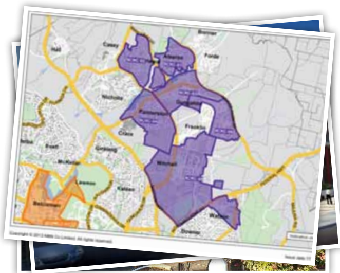
NBNco map of Gungahlin

The Digital Hub at the Gungahlin library continues to be the “one stop shop” for questions about the NBN, and to learn how to get the